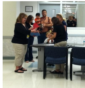
Fall Developmental Screening Day

On October 28 th , 64 children, between the ages of six months and five years, were screened for developmental delays at the Free Developmental Screening Day - our largest screening to date!